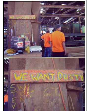
Union members from Boral's Narooma Mill respond to an advertisement for a new manager.

"There is no doubt the seminar was a great success, and the Union is looking forward to organizing similar events in NSW in the near future."