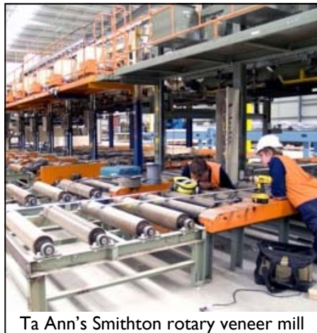
Ta Ann's Smithton rotary veneer mill